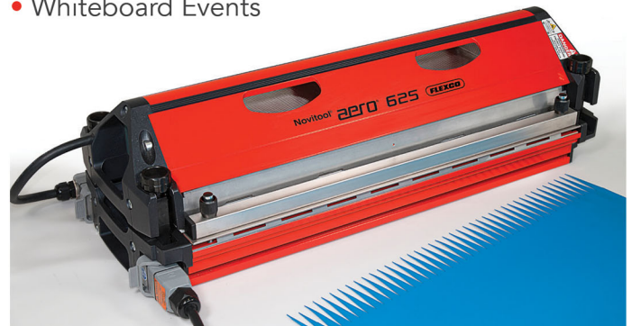
BELT PRESS ▲